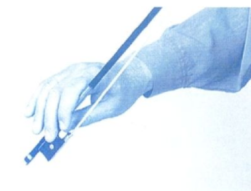
While the different schools of violin playing use similar principles in left-hand technique, right-hand technique differs significantly. Top: Old German hold; middle: Franco-Belgian hold; bottom: Russian hold

but I am not convinced that it is emotionally effective. There are images I give to my students. For example, working with a female student, I ask her, "What kind of person would you like to see as your future husband? Would you like him to be strong or weak?" The answer is always "Strong". "Would you like him to be rough or gentle?" The answer is always "gentle". I then say: "If you will touch the string in the strongest but the most gentle way you will achieve the right expression in the articulation of the note. Touch it in the way you would like the human being to touch you." Usually this kind of emotional appeal works immediately.'